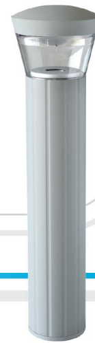
GNS - BL042