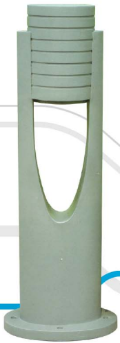
GNS - BL005