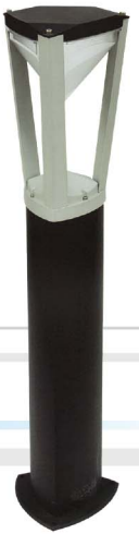
GNS - BL036