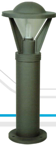
GNS - BL006