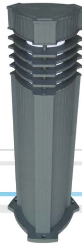
GNS - BL026